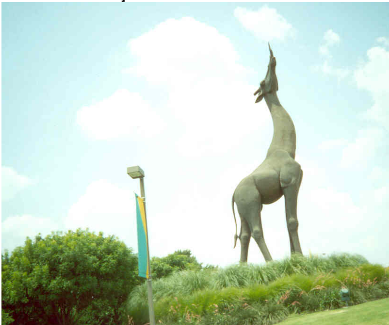
Giraffe Statue – Dallas Zoo

I got another clue that Dallas was not the ultra-conservative place I had imagined inside the train cars. They have an electronic read-out at the end of each car that alternates a crawl of news headlines with announcements of community events and advertisements for various sponsors. One of their biggest sponsors was Planned Parenthood. I don't think I'd seen them advertise on transit even in Los Angeles or New York, but here in Dallas they were right up there with Walgreen's and 7-11. There was also an advertisement for the United Church of Christ, the church I'm a member of and one not at all apologetic for having liberal views. Again, not what I'd expected in Texas—but I sure wasn't complaining. [I have no idea who sells the ads for DART, but it certainly was an eclectic combination.]