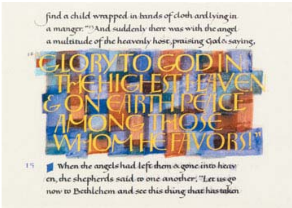
Part of a page from the St. John's Bible

Imagine how enormous the final work of the complete Bible will be. [In fact it's seven enormous volumes.]