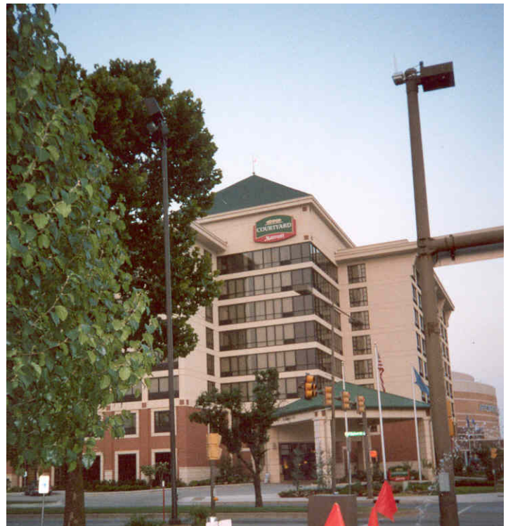
Courtyard by Marriott – Oklahoma City, OK

I was staying at the Courtyard by Marriott. This is a much better class of hotel than I'd normally choose, but in Oklahoma City it was not all that expensive ($85). Parking in a nearby ramp was additional, and with tax the whole thing came to almost exactly $100. Essentially, though, this was also pre-paid. Through the Garrigan scrip program I had bought a $100 Marriott gift card, so from my point of view now the place might as well have been free. Using that gift card was almost more trouble than it was worth. The girl who checked me in was very pleasant, but she hadn't ever seen one of the cards before in her life. She had to call two different people to assist her with how to enter the thing into her computer. It turned out she just had to scan it like a credit card, and—in fact—it came it showed up as "Visa" on the folio. [I think this is the only time I've ever had trouble with a gift card at a Marriott property. I often run into clueless employees at Choice Hotels (Comfort, Quality, Clarion, etc.), but the Marriott hotels seem to train their employees better as to how they need to process different forms of payment.]