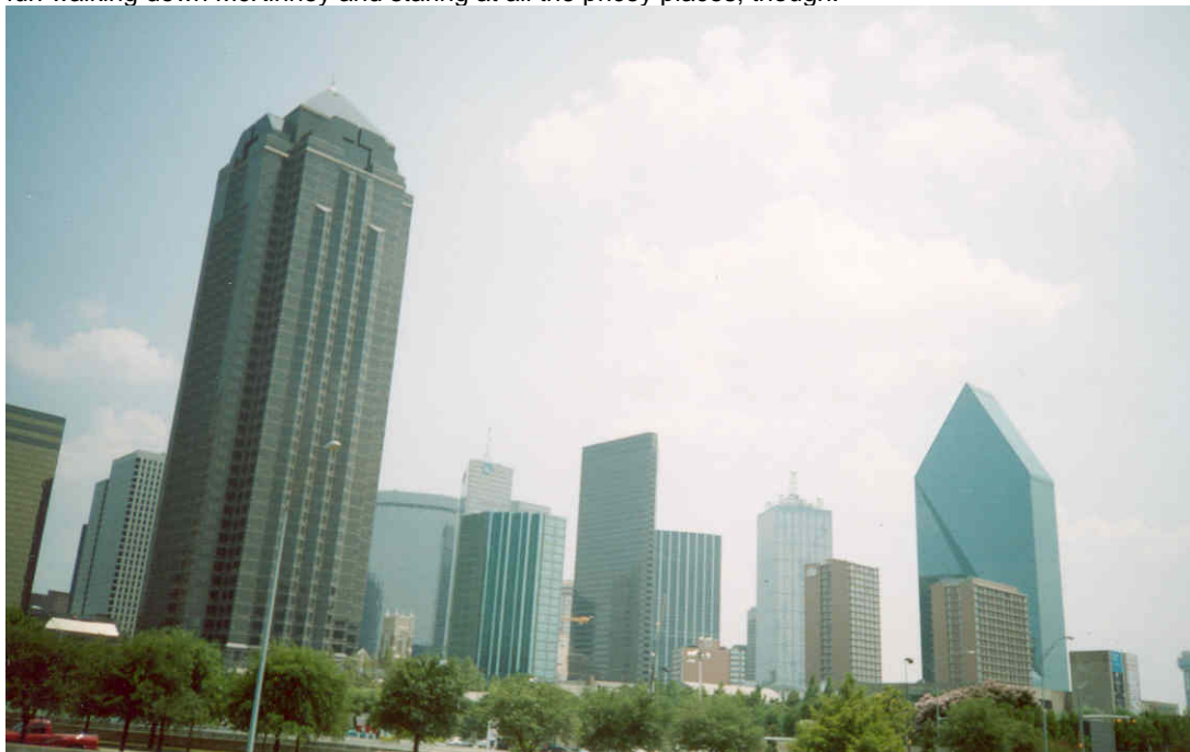
Downtown Dallas skyline

Back downtown I saw one more public square, Pan-American Plaza. While Dallas isn't really a particularly multi-ethnic city, its Texas location is appropriate for a salute to the whole western hemisphere. The plaza features a sculpture by an artist from each country in the Americas. It's supposed to communicate the theme of world brotherhood. I don't know that I'd have gotten the theme without an explanation, but it was an interesting little sculpture park. [I hate to say it, but I honestly don't remember this park at all.]