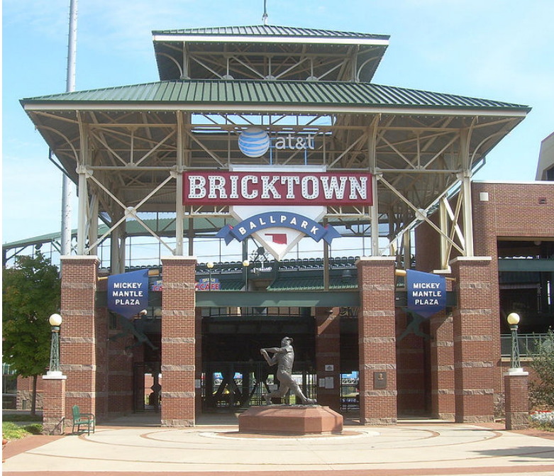
Website photos of what was then SBC Bricktown Ballpark – Oklahoma City, Oklahoma

[I'm pretty sure in the rush to get to the ballpark I left my camera at the hotel. At any rate I have no pictures of my own of "the Brick". Being able to add some to this travelogue is one of the wonders of the internet.]