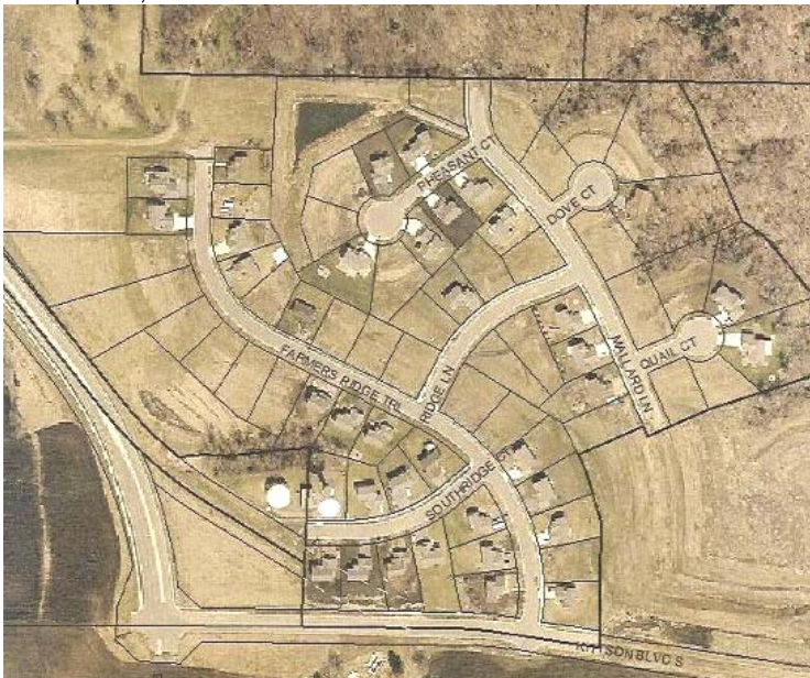
Website plot map of suburban development in the southeast part of Belle Plaine, Minnesota

I had an uneventful drive northward up highway 169. It had been a while since I'd taken this route [and I'm not sure why I took it on this trip—in time, if not miles, it's definitely shorter to follow I-35] , and I was reminded just how much the Twin Cities metro area has sprawled in recent years. When I first moved to Algona, I used to drive up 169 to a mall in Eden Prairie, which at the time was near the southern extent of the Cities. At that time the town of Belle Plaine marked the halfway point between Mankato and the Cities. Today the suburbs have crawled southward to the point that Belle Plaine is essentially the start of the Twin Cities—even though it's more than twenty miles from the beltway. There's still a lot of trees and farmland in the area, but there's a lot of condos and office parks, too.