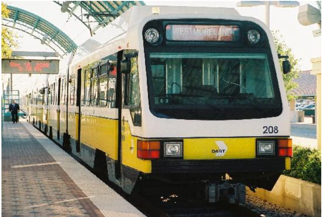
Website photo of a DART light rail train

didn't put tons of money into the trains. Dallas has very simple, rather old-fashioned looking cars on their trains. They're not eye-catching and futuristic, but they don't need to be. The stations are also not elaborate, but they're clean and functional. Most important, though, the vast majority of Dallas' light rail route runs in an exclusive right-of-way. Except for right downtown, the train doesn't have to stop for traffic (or make traffic stop for it). The suburban stations are spaced quite far apart, so the train can serve as truly rapid transit.