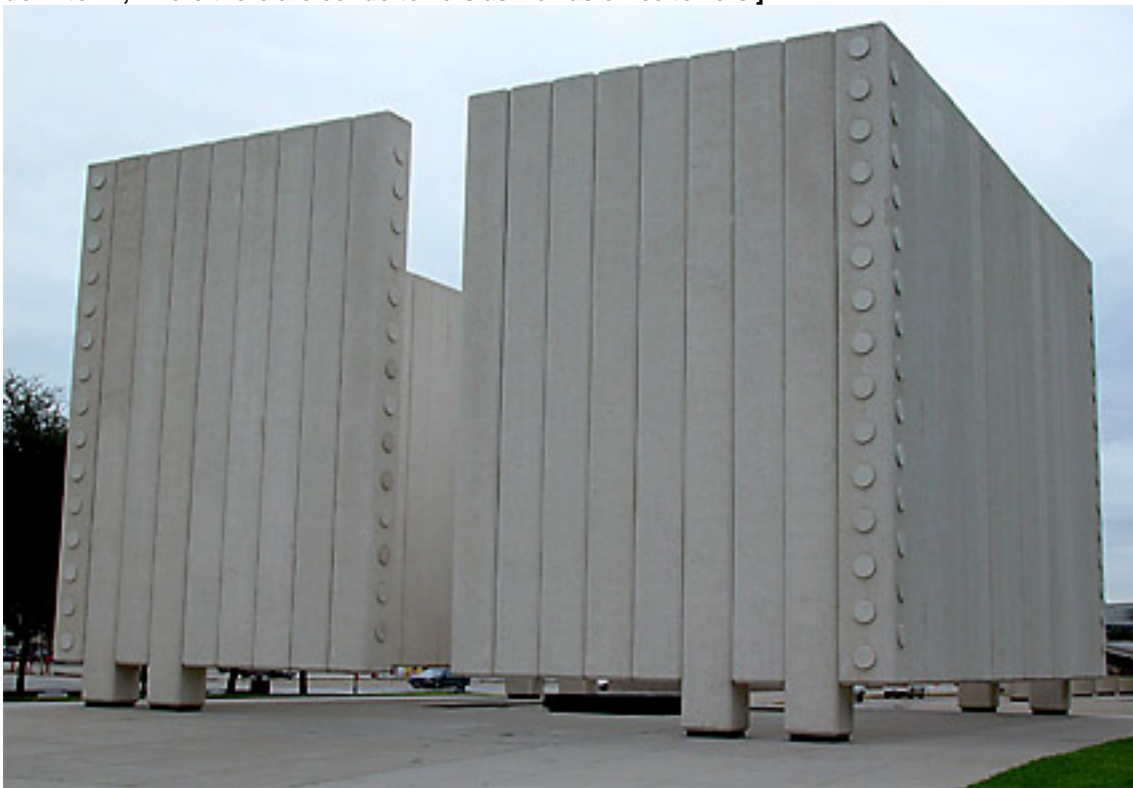
Kennedy Memorial Plaza – Dallas, Texas

Honestly, there's not all that much to see—especially on a Sunday. Downtown Dallas is one of those places where people make money on business days, but it's virtually deserted on the weekend. There's basically nowhere to shop, and no one (except a few homeless people) appears to live downtown. There are quite a lot of restaurants, but they're only open for breakfast and lunch Monday through Friday. Today the whole place was about as dead as could be. [Having been to a lot of cities, the lack of downtown residences is the biggest problem in downtown Dallas. Successful cities are those where people actually live downtown, where there are condo towers as well as office towers.]