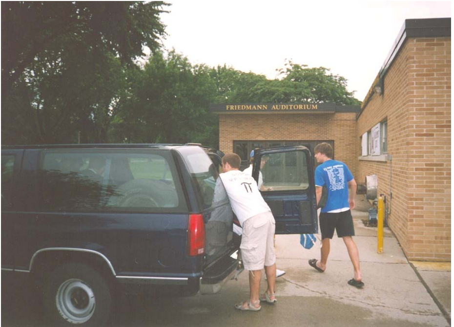
Packing up the suburban

We picked up the final member of our group in the nearby town of Wesley. Also making the trip to Chicago (in a separate vehicle) were this kid's parents, his sister (a former quiz bowl player who had helped chaperone kids at nationals several years ago), and her husband. They were very concerned that we stick together the whole time, that the vehicles not lose visual contact. They'd even brought along a set of modern-day walkie-talkies that we could use in case we couldn't see each other. Things never work as planned. When we eventually did lose visual contact on the Northwest Tollway in Illinois, the walkie-talkies brought only static. My back-up idea was to call the parents on their cell phone, but apparently they had their phone turned off. I'd written very detailed directions, though, and apparently they worked okay.