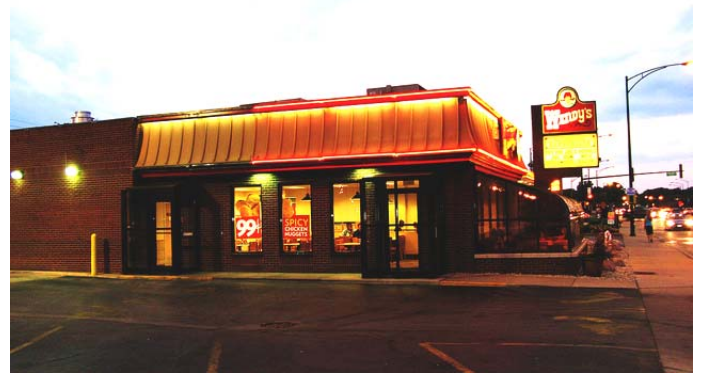
Wendys on Harlem Avenue – Chicago, Illinois

While I finished my dinner in just a few minutes, it took the kids quite some time to down burger after burger after burger. I was not particularly comfortable as they spent much of dinner discussing the alcoholic exploits of some of their fellow students. They'd all now graduated, but it still wasn't really what I cared to hear. I was more comfortable when they parodied some TV comedian who apparently uses the signature line “I'm not gonna lie to you”.