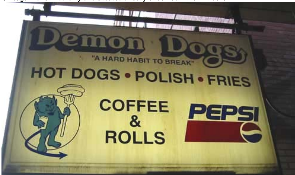
Demon Dogs sign on Fullerton Avenue – Chicago, Illinois

When we had eaten at the hot dog stand yesterday, I had described Demon Dogs (a hot dog place near DePaul University that was owned by the rock group Chicago and decorated with their memorabilia) to the kids. They thought that might be an interesting place to have lunch, so we took the red line north to Fullerton and got off there. The kids were amazed at how cheap the place was—for $2.50 you can get a filling meal of hot dog, fries, and a drink. The place is just about the cheapest restaurant in Chicago. That's partially because its wealthy owners sell the food virtually at cost and partially because it is housed in a ratty building owned by the Chicago Transit Authority and situated directly underneath the 'L' tracks.