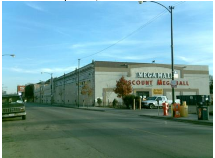
Discount Megamall on Milwaukee Avenue – Chicago, Illinois

Back at the hotel, the kids packed up slowly. That was okay, since I wanted to wait until after the rush hour traffic was over to set off for the day. We checked out and were on our way around 10:30am.