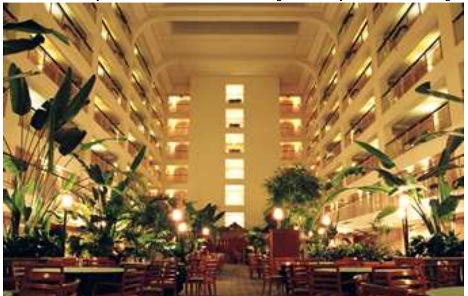
Atrium at the Embassy Suites—O'Hare – Rosemont, Illinois