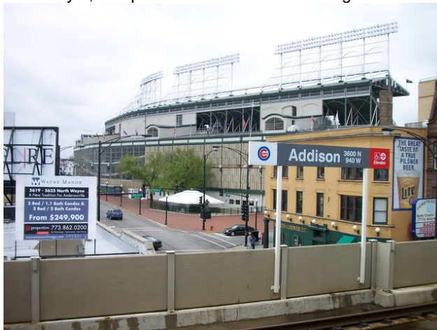
Wrigley Field from Addison 'L' station

as of July 1, the place is no more. While neighborhood residents wanted the place declared a historic landmark (a status the main entrance to Fullerton station across the street has), it's probably correct that the judge denied that request. The Demon Dogs building was old and dumpy, but not really historic, and a quirky hot dog stand—even if it is owned by famous people—probably shouldn't stand in the way of progress. Even so, I must say I'll miss Demon Dogs. [The renovation is now done, and I must say the new Fullerton station is much more pleasant than it was before. Without Demon Dogs there, though, there's not a lot of reason for me to exit at Fullerton.]