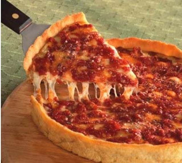
Website photo of Chicago deep dish pizza

The kids played cards while we waited for our food. I mostly watched the other customers in the place. There was an amusing couple in direct view of me. The woman ate nothing but a small salad, but the man finished an entire Chicago-style pizza (small, but still around $20 and probably about 2,500 calories [actually likely more than that] ) himself. Surprisingly, the guy was not at all fat. He contrasted with the many police officers in the place, most of whom furthered the old stereotype of the fat Irish cop.