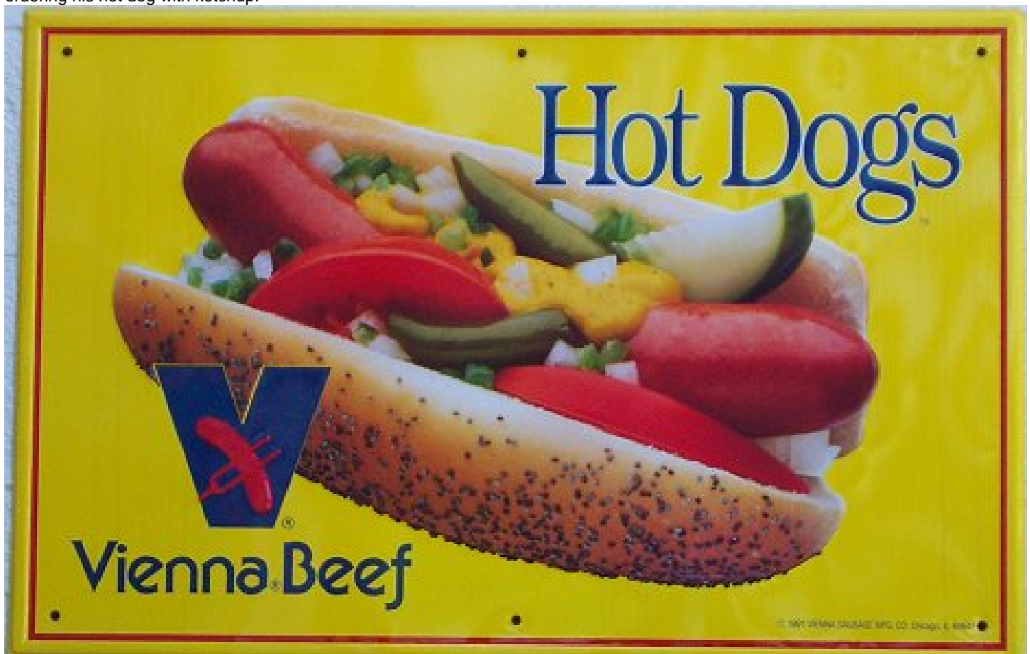
Sign illustrating the classic Chicago style hot dog

The kids said they wanted to buy hotdogs from a vendor cart. There are almost no pushcart vendors in Chicago, so they had to settle instead for one of the ubiquitous hole-in-the-wall hotdog stands that are scattered around the city. [It turns out Chicago health regulations forbid vendor carts. They've also made the food trucks that have become ubiquitous in other cities almost unheard of in Chicago. Potential food vendors have appealed several times to have the regulations relaxed, but if anything they have been strengthened.] We ate at a place called Downtown Dogs that said it had "the best classic Chicago-style hot dogs". Having eaten more than my fair share of them, I knew a classic Chicago dog is a boiled jumbo frankfurter with neon green relish (it looks like radioactive waste), a pickle spear, chopped onion, tomato, "sport peppers" (little spicy pickled peppers), yellow mustard, and celery salt on a poppy seed bun. I've described it elsewhere as "spicy salad on a bun". A hot dog "with everything" is assumed to have those, and only those, accoutrements. Anything else—more or less—needs to be specifically specified. I told the kids this before we entered, and they ordered like pros—though every one of them gave himself away as a tourist by committing the anti-Chicago sin of ordering his hot dog with ketchup.