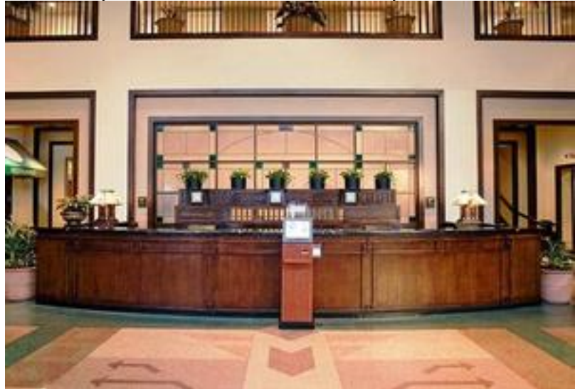
Outside and lobby area at Embassy Suites—O'Hare