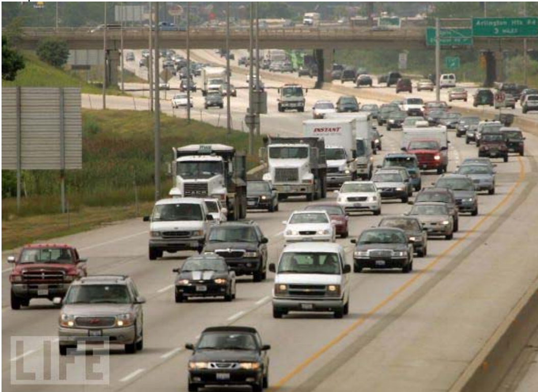
Website photo of the Northwest Tollway in the suburbs of Chicago, Illinois