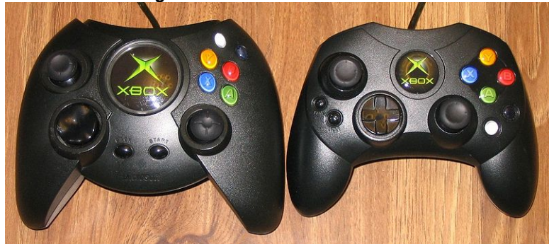
BELOW: Xbox game controllers with unlabeled alien buttons

Museum of Science & Industry – Chicago, Illinois